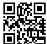
MilDef Crete Australasia