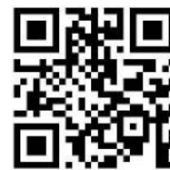
MilDef Crete Inc.